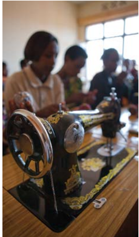
Right: Women at the Abasangiye Cooperative in Kayonza participating in sewing and handicrafts training, in a partnership between AVEGA, SURF, Foundation Rwanda and Indego Africa