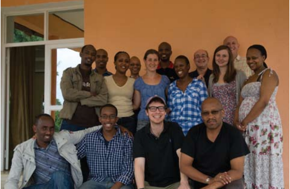
The SURF Rwanda Team with UK Trustees and Chief Executive on Away Day in March 2012