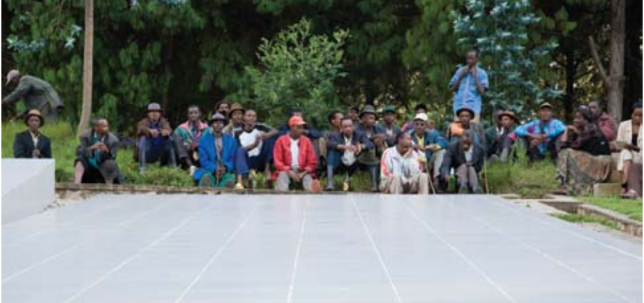
Survivors of Bisesero in the Western Province of Rwanda, where SURF plans to support a new programme in 2012