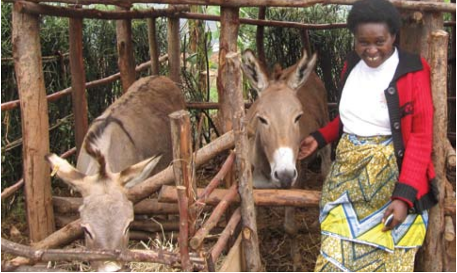
A young survivor with donkeys distributed through funding from the Good Gifts Catalogue