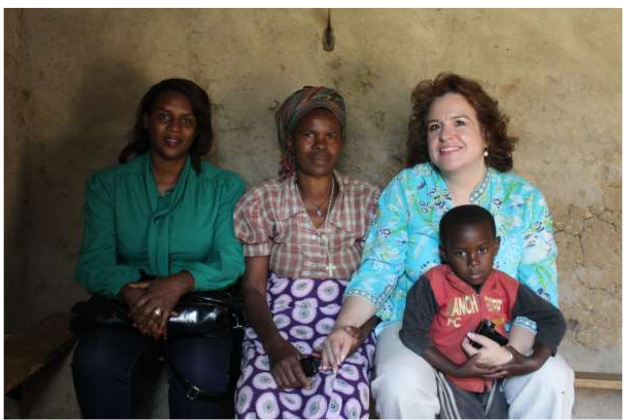
SURF's chair person on the right visiting project beneficiaries.

The project also provided entrepreneurship training, income-generating activities and access to loans. Almost three quarters of participants (2,653 people) received entrepreneurship and business management training. Subsequently, 1,271 of them accessed loans. The target to give 900 loans was exceeded by 41%.