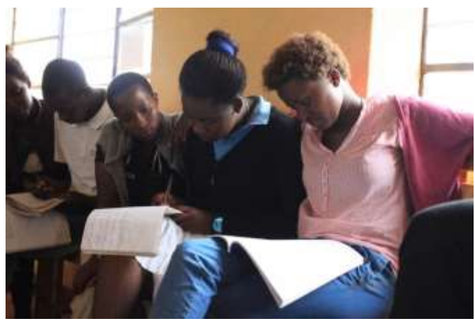
Young survivors attending entrepreneurship training

ELE is enhancing the livelihoods of 946 vulnerable young people in Rwanda and their 3,200 dependents, through entrepreneurship training and access to capital conjoined with support to enforce their legal rights and address their trauma. ELE's holistic approach is transforming the lives of vulnerable young survivors by enabling them to create and secure income, and in so doing eradicate their extreme poverty and hunger, and that of their dependents. Since its launch, 57% of beneficiaries are running businesses as opposed to just 19% at the start, 94% have increased their incomes, trauma symptoms among beneficiaries have been reduced from 45% to 24%, and 292 individuals are actively enforcing their legal rights. Through the project, vulnerable young survivors, and particularly women, are generating the confidence and know-how to sustainably access incomes, integrate into their communities, provide employment for others, access justice and foster economic development.