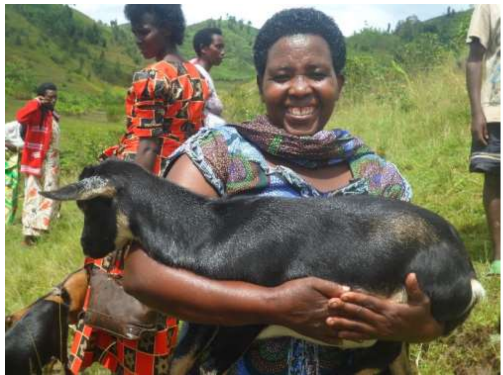
One of the beneficiaries of the Good Gifts Project

These women, who were previously marginalised, stigmatised and alone in their trauma, were able to build their confidence and self-esteem, increase their knowledge, enhance positive emotions and reduce shame. The counselling groups also helped to improve relationships with their children and family.