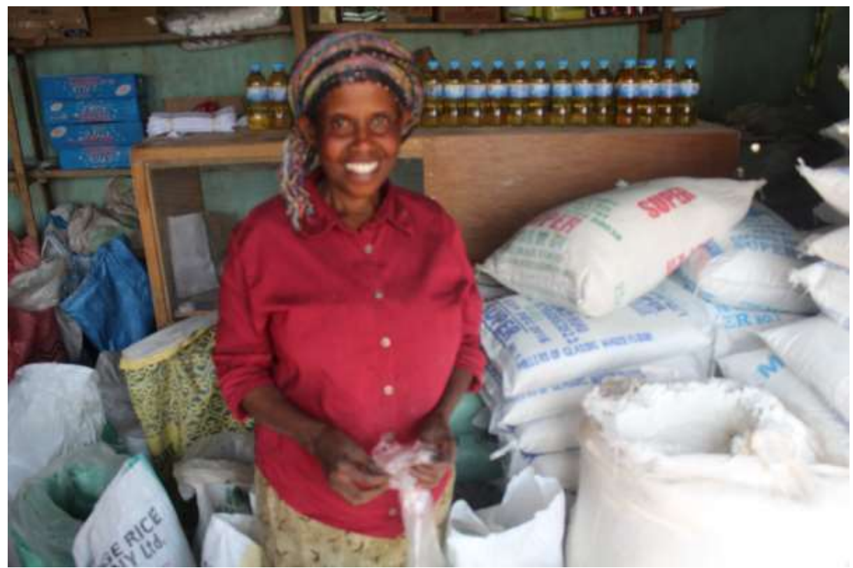
Beneficiary of economic empowerment project

Here we describe a selection of our work in 2015, and look forward to the work that we plan to undertake in 2016.