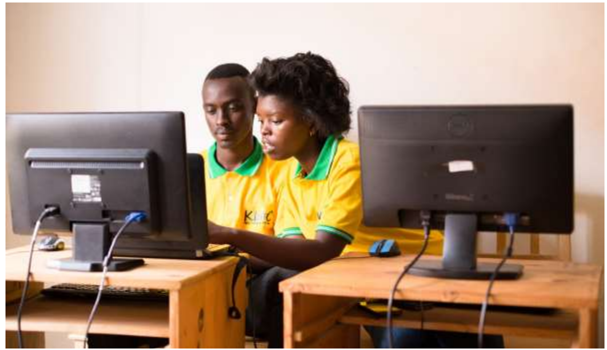
Pictured above are some of students attending computer training