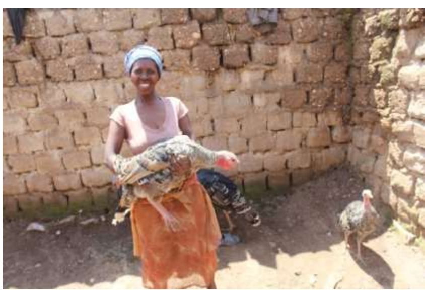
One of the beneficiaries of the Good Gifts projects

Funding from Good Gifts enables us to provide survivors environmentally friendly technologies such as solar lamps and smoke-free cooking stoves. The women are enthusiastic about the fuel savings, since they do not have to worry much about collecting firewood. Widows also noted other benefits: cleanliness, nutritional aspects, freedom from smoke inhalation, and the women say that they are now saving up to six hours each week as a result of the improved stoves. This has solved many of their families cooking problems.