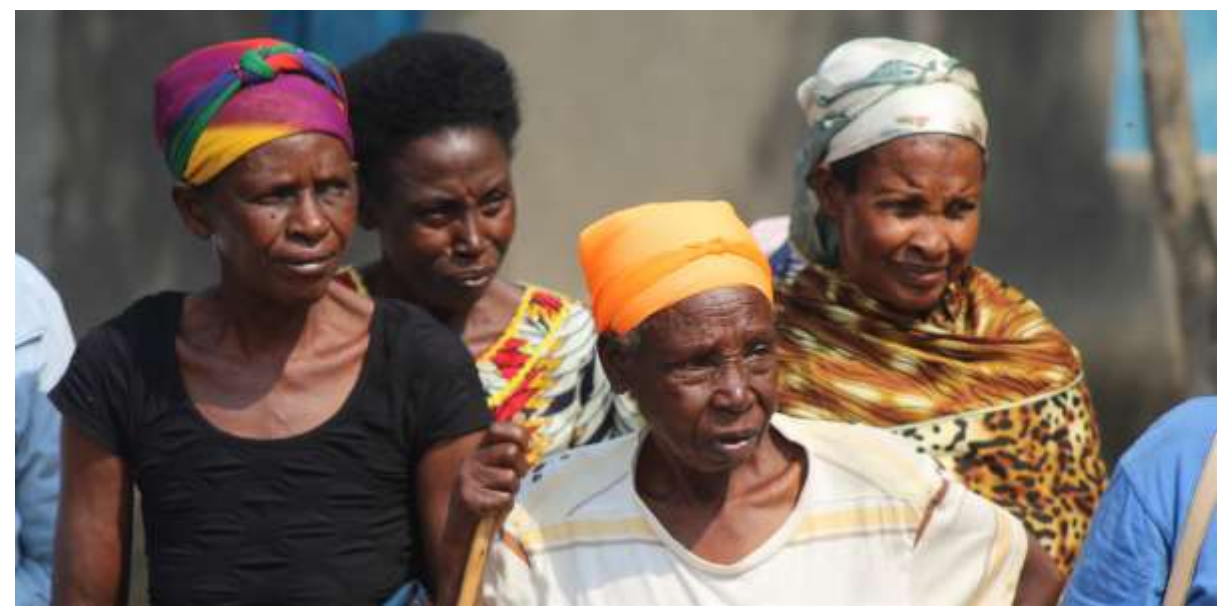
Pictured above are some members of AVEGA

In March 2015, at the conclusion of the project we commissioned an independent evaluation of the project, undertaken by Lifetime Consulting. The project scored an A+ rating from DFID, with the report concluding that WSEP: "has made significant contributions in the lives of people. Among some of the key achievements, it is apparent that the project has supported widows to actively participate in entrepreneurship activities, leading to increased knowledge and skills to participate in IGAs, savings and credit schemes. As a result of training offered by the project, participants reported improved livelihoods and food security. In addition, more participants were supported to access legal support and counselling as a result of this project. The project also supported more people to access HIV testing services, leading a significant increase in the number of widows maintaining ARV treatment regime. A secondary outcome resulting from improved livelihoods was an increase in the number of dependents who were able to transition from primary to secondary schools, as well as those in graduating secondary school. Overall, the findings are remarkable."