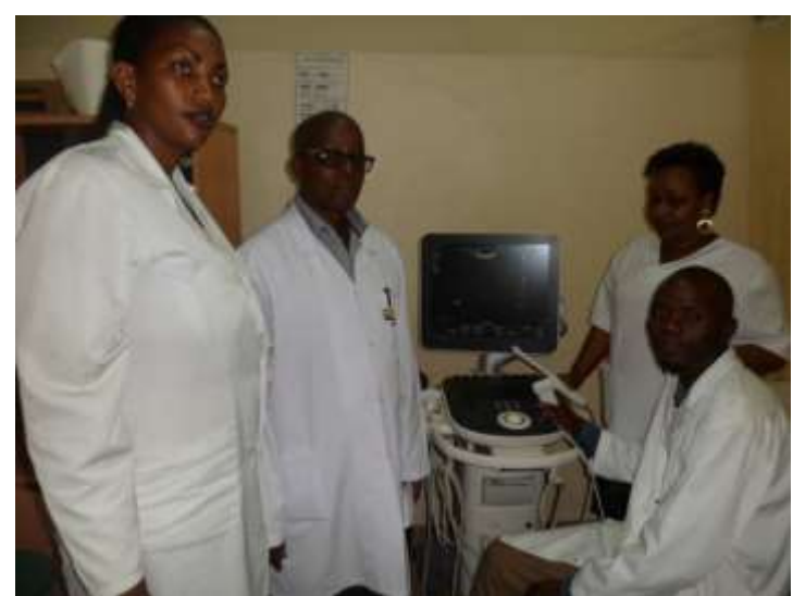
AVEGA's medical team that received training on how to use a donated ultrasound machine

Last year we advocated for FARG to support students who have graduated from school, but require support for higher education. As a result, seven students were granted full scholarships to university which includes hardship support. This enabled us to provide educational support to more students. SURF supported twenty-two students through university in 2015 with support that ranges from tuition of about £600 to comprehensive support which includes school materials, accommodation and transport which amounts to an average £1,000 a year. Six students from the programme graduated last year. A number of students studying IT and Accountancy were supported specifically by funds raised in honour and memory of the late Benon Banya, SURF's accountant who tragically died in 2013 whilst undertaking a sponsored climb of Mount Kilimanjaro.