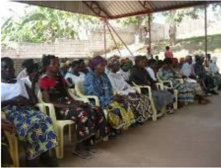
Group counselling at Nyanza community.

A visit to the communities upcountry is always a way to consolidate the family concept of Solace. It encourages the communities members to know that they are cared for and are part of a nationwide family.