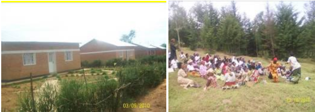
the new village at Rukumberi and nyanza fellowship

Shelter remains one of the most crucial issue among our widows and orphans. We still have a lot of demands for accommodation that we cannot satisfy.