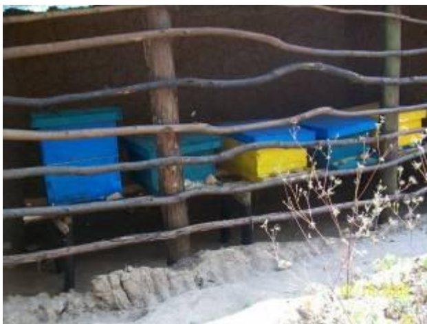
bee hives at Rusatira