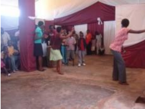
worship to God with their dances and songs.

No one can win young people without music, games and sport. It is in this respect that Solace Ministries has undertaken to promote football and other re-creative activities. Many communities have already established folk dance troops which express praise and