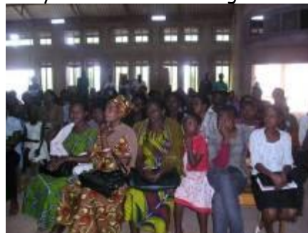
During a visit at Nyamirambo and meeting at Solace Centre

During school holidays, the sponsorship department organized a fellowship meeting with sponsored children in Kigali. The important of such meeting is crucial because sponsored orphans are talked about the main principles of the sponsorship program, they share testimonies, they pray for each other and the new ones get an opportunity to know each other with the old ones in the program.