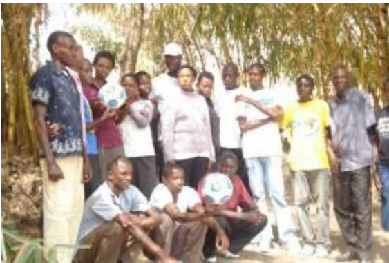
meeting under a tree, ntongwe

The word of God is thus shared and young people share their testimonies. We have been also rejoicing to see the young men giving advice to others about on behavioral issues during the youth camps or meetings. An interesting thing is how the traditional culture is translated into values of Christian life through dances, poems and all other activities.