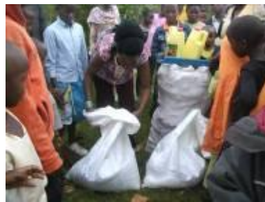
In Bicumbi, after the

Christmas celebration, they donated food items, cooking oil and soap as a Christmas gift to the Orphan Headed families in Kigali.