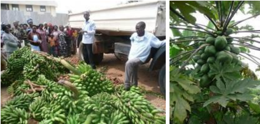
of an OHH in Nyamata.

This project aims to have 1,000 families of widows and orphans each owning a dairy cow. We rejoice in the Lord for the families that have already received a cow because there is an obvious positive change in their lives and their way of living