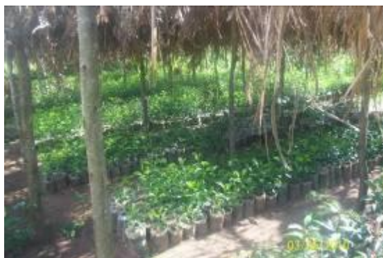
Nyanza nursery of fruits

Families of widows and orphans are encouraged to use their lands and properties for productions. Support in kind such as seeds and other agricultural input are provided when necessary. The local committee supervises the activities all aiming to fight against famine and to create income. As a matter of fact, most women have now their own bank accounts and have started to develop a habit of saving.