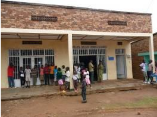
sponsored children at Kabuga Solace Office