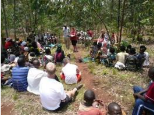
a visit on field with partners

God is creating a universal family through which His Name is being glorified, a family that is called to proclaim his wonderful works among his people.