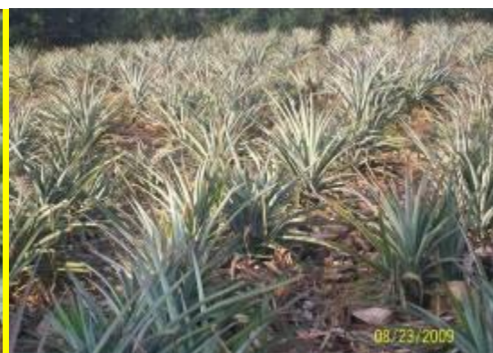
pineapple for Nyamata farm