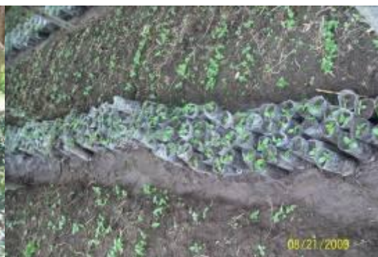
Nyanza nursery when was very small