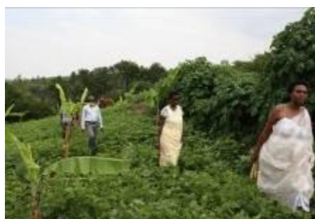
The new land, full of banana, beans and Peanuts