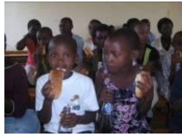
Sponsored children in