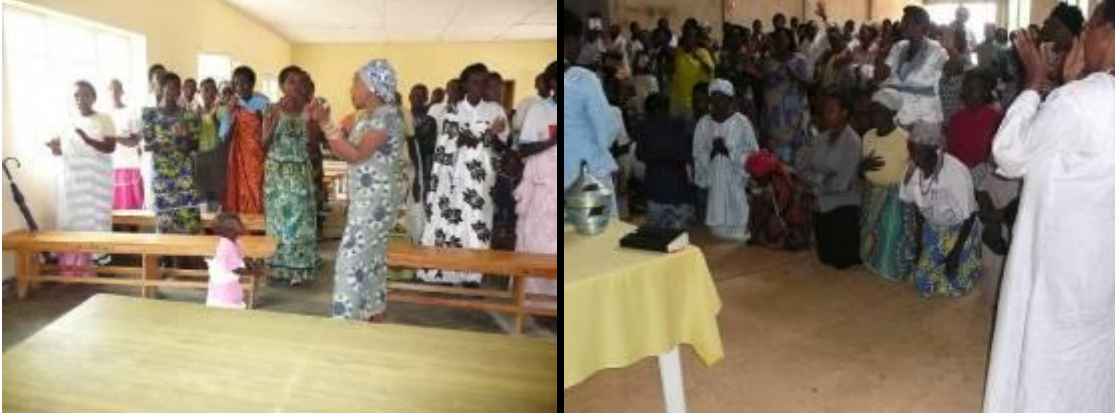
Praise and worship at Kaduha and a special touch of the HS at Solace Centre Kigali

The youth we serve are orphans and have no authority figure at home or elsewhere. Solace Ministries has been called to stand in the gap on behalf of their deceased parents. We are seeing now, as a result of the program, that we have very dynamic and creative young people. They are being mobilized to behave the way well educated children should and are rejoicing to be part of the ministry. Likewise, communities of mainly widows are creating fellowships to share the word and to pray together. Sessions, through which they come together to care for one another, are taking place regularly just as they should be in a family.