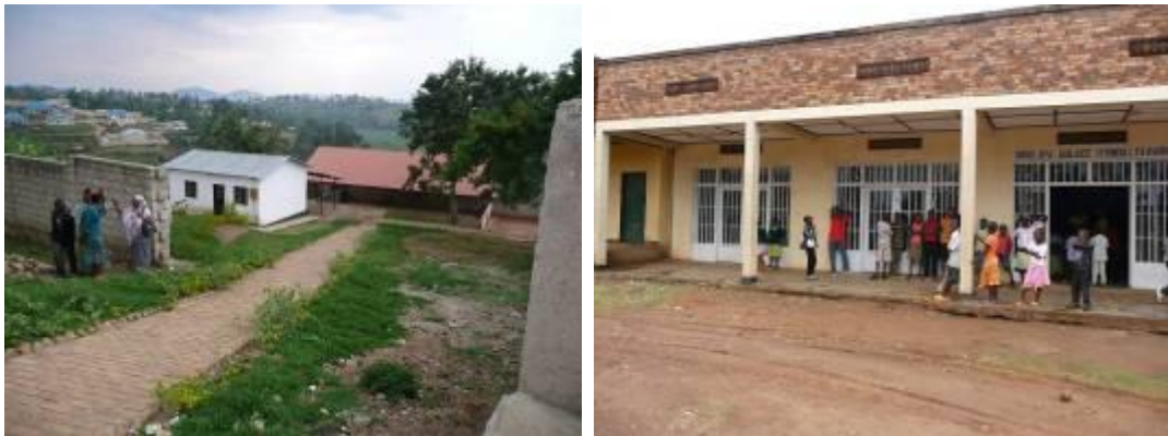
Nyanza regional centre under construction and the Kabuga regional office