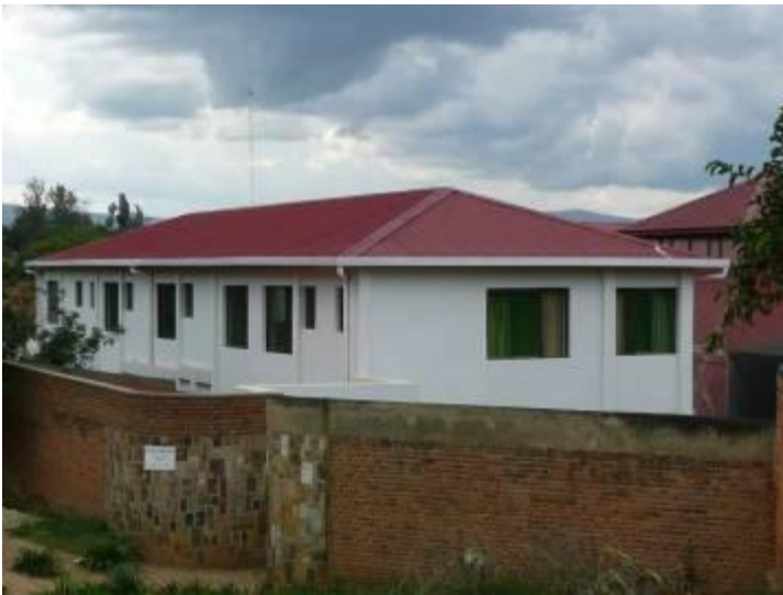
The main Office at Kigali

God is creating a universal family through which His Name is being glorified, a family that is called to proclaim his wonderful works among his people.