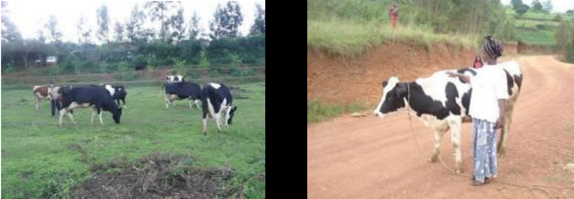
Solace cows at Kabuga demonstration farm and Clotilda receiving a cow at Jurwe, Gasabo.