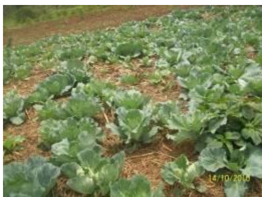
Nyamata farm growing cabbage