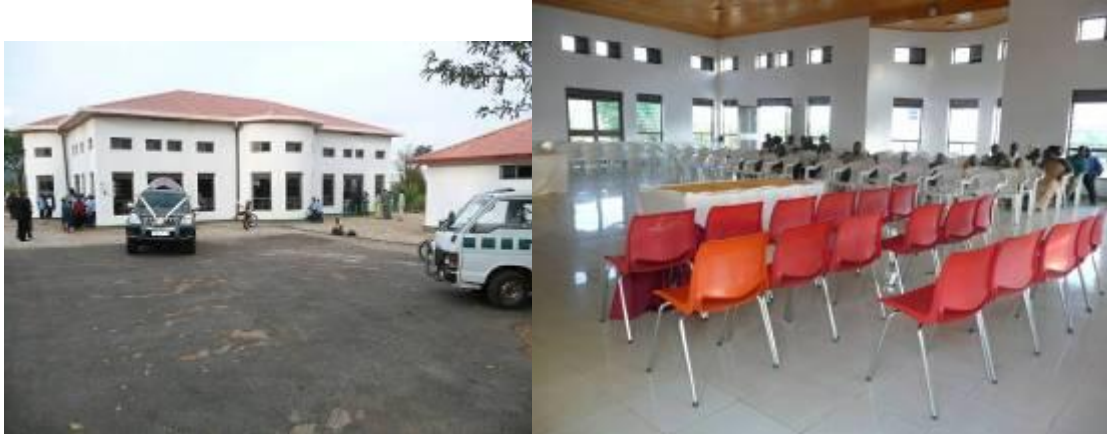
The Nyamata community hall regional centre

We thank God for the centre in Nyamata which is being used by the members of the community for their regular meetings. Weddings and different other conferences and meetings are already taking place there but not yet at a large scale. However, they help to find income needed for maintenance, water and electricity. The compound in Nyanza has been arranged and a hall that contains 300 seats is now operational.