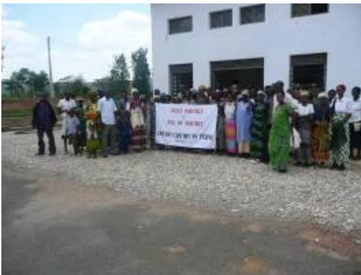
The Nyamata community at the Centre