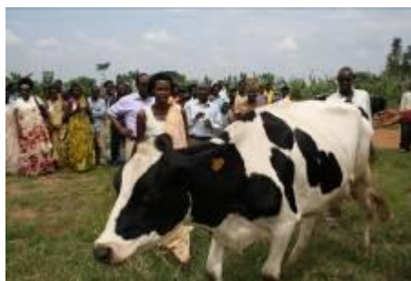
Dancing with joy after receiving cows