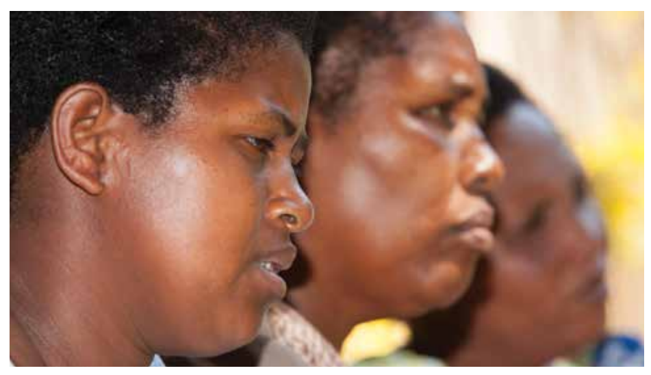
Women attending the Community Counselling Initiative as part of the Foundation Rwanda project