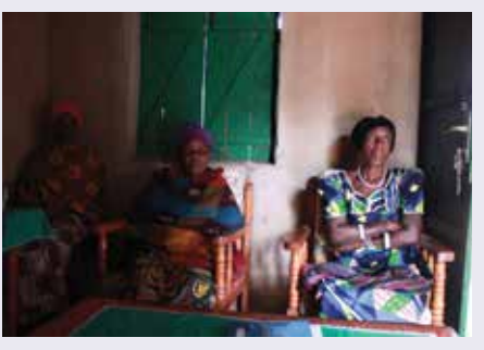
Members of the Duhumure group

The group members are happy with the state of the current loan, but are unsure if they want to take out a second loan, as they highly value their independence. Interest rates for micro-credit loans are higher than bank loans, in general. This is also a strong factor in determining whether the group will